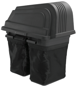
ZTR® ZERO TURN DOUBLE BIN COLLECTION SYSTEM 587 41 24-01